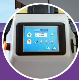
GLCD TOUCH SCREEN Control at your fingertips.