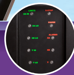
SELF DIAGNOSTICS Confirm that everything is working properly.