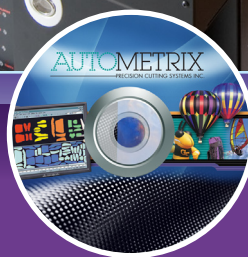
PATTERNSMITH SOFTWARE Easy to use cutting software to save time, money and materials.