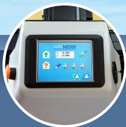
GLCD TOUCH SCREEN Control at your fingertips.