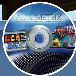
PATTERNSMITH SOFTWARE Easy to use cutting software to save time, money and materials.